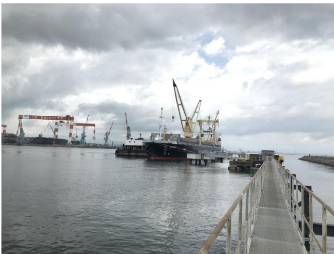
↑ Unloading point at TSU port

Arrived 06:28 1st July Berthed 07:10 1st July ET.comm disch 13:30 1st July ETD 16:00 6th July (*No work on Sunday) TOTAL AMOUNT: 8,333.00 MT