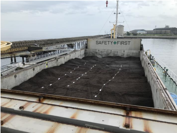
↑ No.1 hatch before unloading