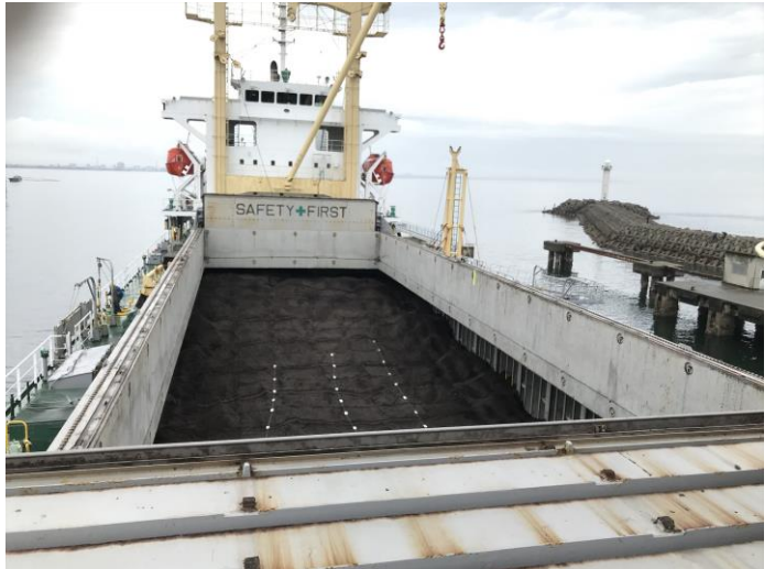
↑ No.2 hatch before unloading