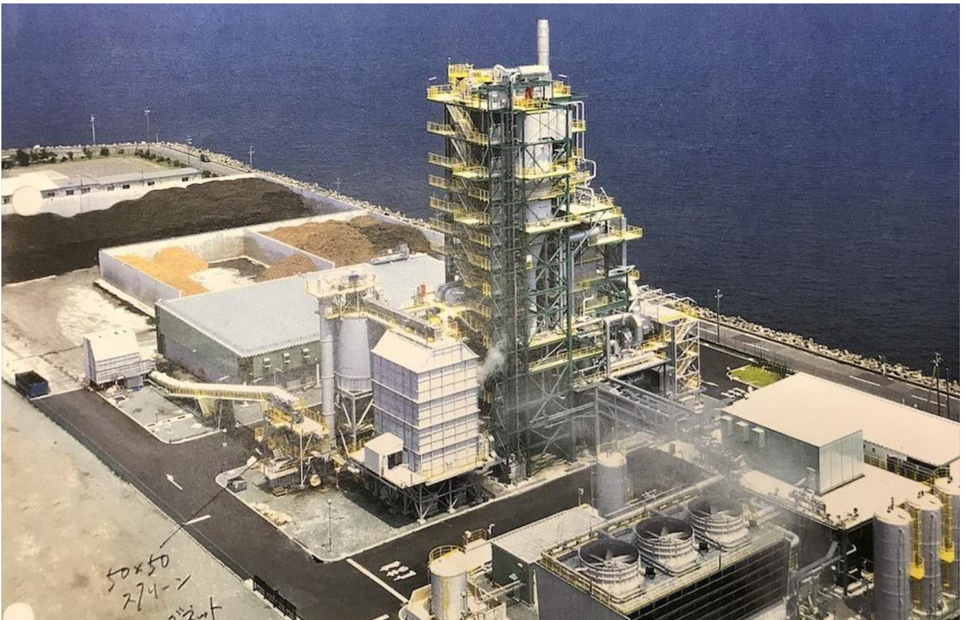
↑ Green Energy TSU biomass power plant