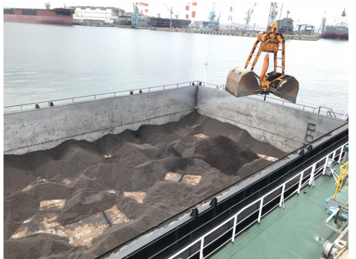
↑ Barge JFEE is using