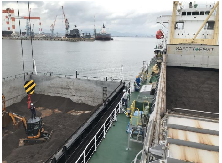
↑ Transport from No.2 hatch to barge