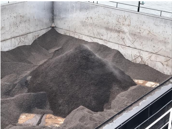
↑ The steam is out from PKS