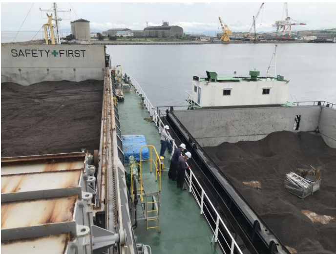
↑ Transport from No.1 hatch to barge